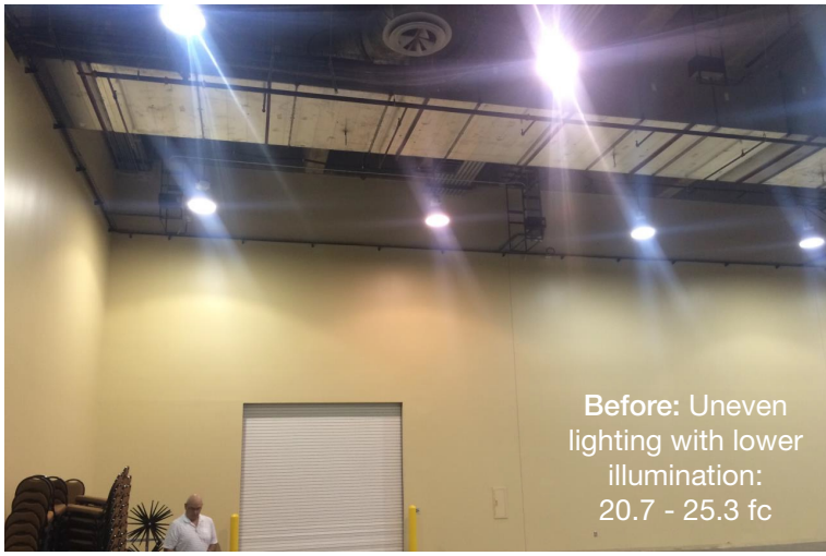
Before: Uneven lighting with lower illumination: 20.7 - 25.3 fc